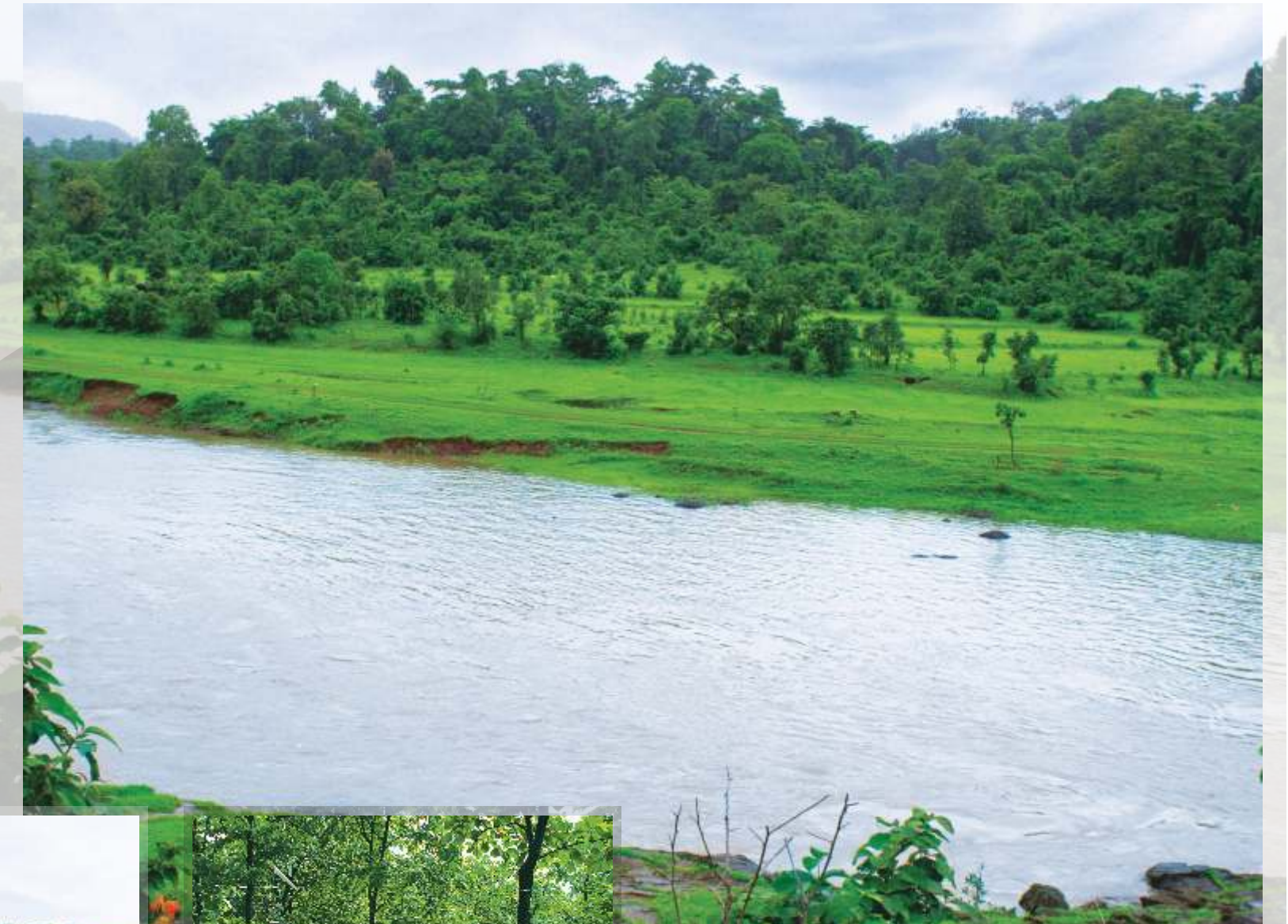
Actual pictures of the surrounding location